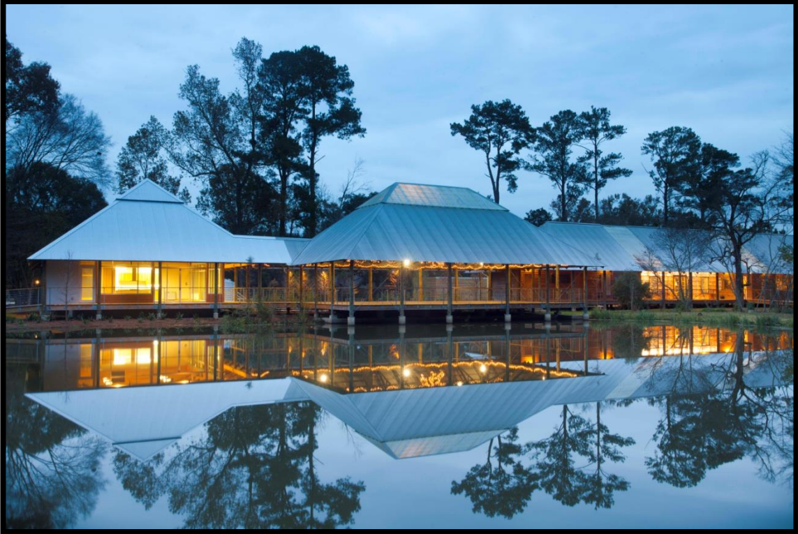
7. Beverly Brown Coates Auditorium and View of Pond